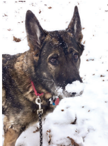
Who doesn't love a snow day?